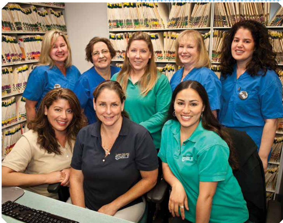
The highly qualified Long Island Dental Sleep Medicine staff

To learn more about Long Island Dental Sleep Medicine, visit www.longislanddentalsleepmed.com . ■